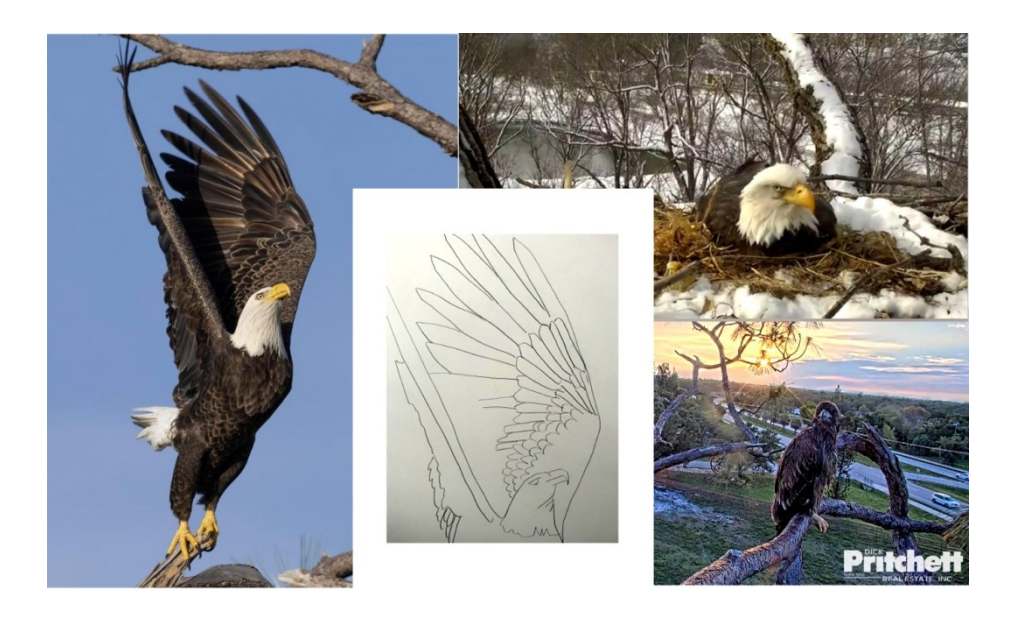
Did you know... I'm an avid Eagle nest watcher?!

There are several nests across the country that have live cams set up for viewing. I've been following a nest in South Florida for many years. (This nest was my inspiration for my eagle art that is presently 'waiting in the wings' at the moment-haha)